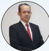
Dr. Ir. M. Basuki Hadimuljono, M.Sc. Minister of Public Works and Housing Indonesia